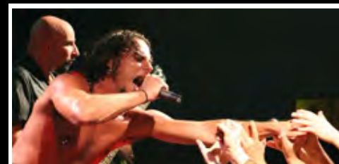
Breed 77 welcome you in.

Mixing their Mediterranean influences with contemporary rock and metal in a combination of English and Spanish, Breed 77 have come up